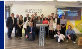
Anprotec's London Mission