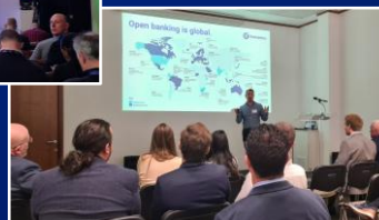
FinTech Week London