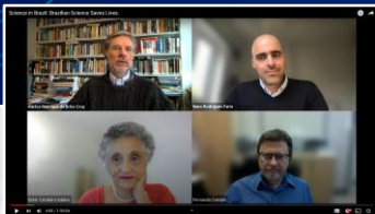
Science in Brazil Webinar Series