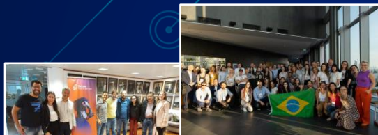
London Tech Week